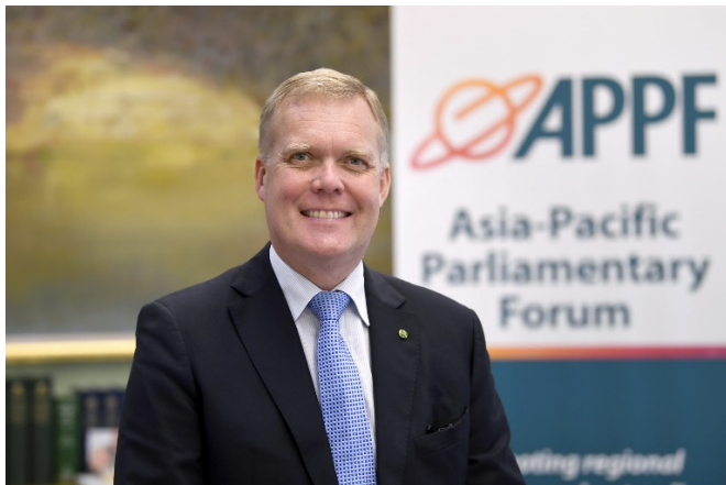
A video message to APPF members

The Hon Tony Smith MP, President of the APPF and Speaker of the House of Representatives, Parliament of Australia, speaks to APPF members at the conclusion of 2020, a challenging year for everyone.